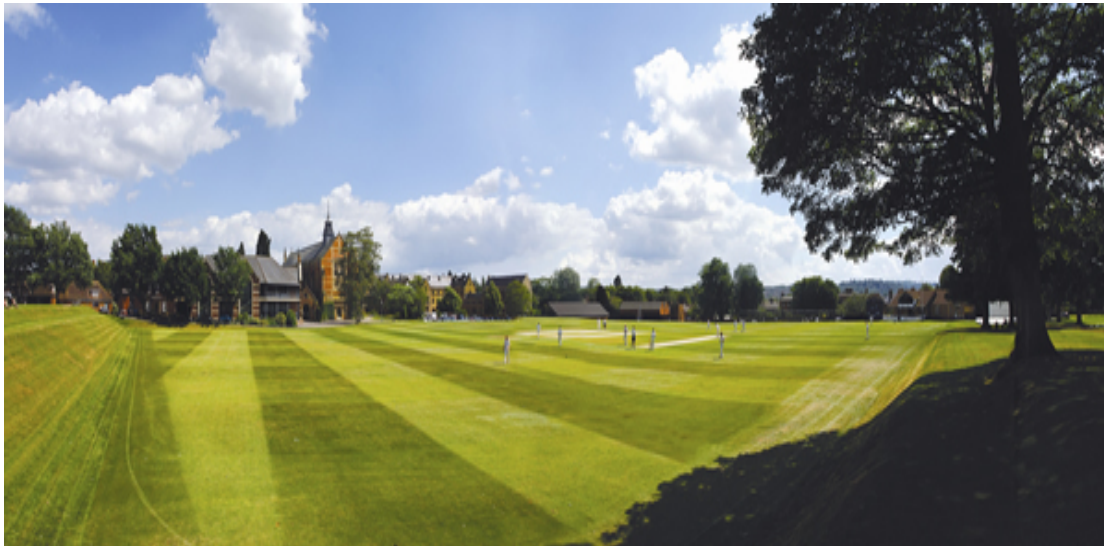
Cricket played on the Head – the First XI pitch.

Tonbridge is well known as a school which offers many forms of sport to its pupils. In addition to the traditional field sports such as cricket, rugby, hockey and football there are around 15 other sports on offer such as badminton, rackets, cross country, golf, shooting and Ultimate Frisbee. All boys are encouraged to take a full and active part in the sporting programme and competition at both inter-school and inter-house level is well supported. A number of Tonbridgians carry on to professional sporting careers, particularly in the fields of cricket and rugby.