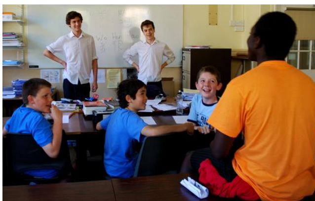
Sixth Formers with primary schoolchildren on Charities Day

Tonbridge aims to provide an unsurpassed education of excellence and breadth. We focus our efforts and resources on achieving this by offering, amongst other things, a vibrant and balanced programme of co-curricular Breadth and Depth. Involvement in sport, music, art, drama and many other activities underpins a culture of creativity, innovation and excellence. The co-curricular programme also provides opportunities for service to others, and the development of self-reliance and leadership skills. This ranges from a popular CCF to an extensive range of outreach activities. We encourage a strong sense of social responsibility in the school community which includes our sponsorship of the Marsh Academy.