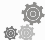
Career Progression and upskilling opportunities