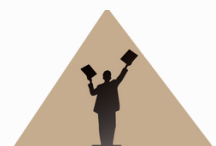
Annual Trust Awards

We are happy to talk about flexible working.