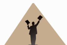
Annual Trust Awards

We are happy to talk about flexible working.