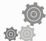
Career Progression and upskilling opportunities