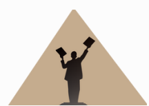
Annual Trust Awards

We are happy to talk about flexible working.