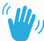
A diverse and inclusive workplace