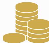
Competitive salary with annual pay progression