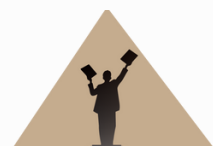
Annual Trust Awards

We are happy to talk about flexible working.