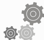
Career Progression and upskilling opportunities