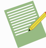
Trust-wide training and networking events