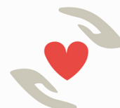
Flexibility for life events