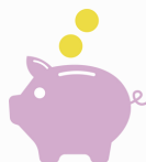
LGPS/TPS Pension Scheme & Generous Contributions