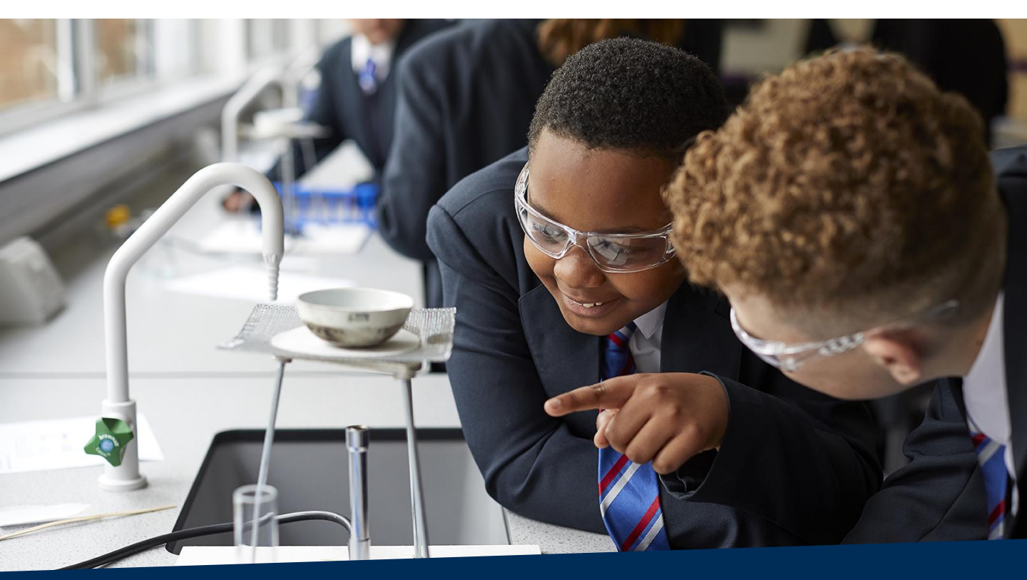
St Gregory's students make the world a better place