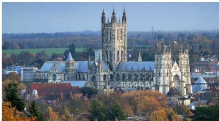
A VIEW OF CANTERBURY CATHEDRAL FROM THE PICTURESQUE HILLS OF KENT UNIVERSITY.

We have a successful partnership with The Langton, which offers a grammar school stream in the school, co-operation in planning and delivering provision for students with ASD, A Level teaching and combined delivery of elite Post 16 sport. This enables us to offer a comprehensive education to the children and families of this area and provide a variety of pathways to success in academic study, sport, performing arts, practical learning and enterprise education.