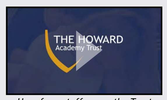
Hear from staff across the Trust