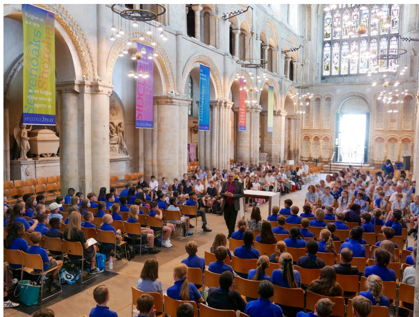
Diocesan Schools' Festival, Rochester Cathedral, June 2025

The RDBE and its officers work in partnership to provide 'life in all its fullness' to its schools, the parishes which support them and their local communities. They do this in line with the Church of England Vision for Education: Deeply Christian, Serving the Common Good (2016).